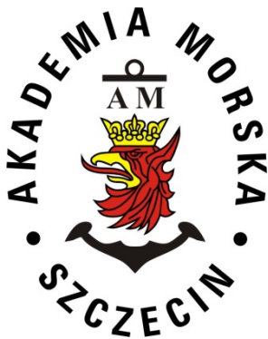
Maritime Academy of Szczecin