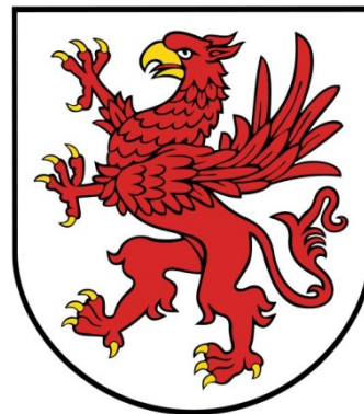
Government of the Wojewodztwo Zachodniopomorskie